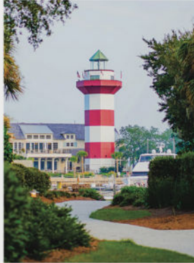
Clockwise from top: Harbour Town Lighthouse; a cocktail at Hilton Head Distillery; bike riding on the beach; Quarterdeck.

DAY THREE ☉ No break from the sun? Soak yourself to a bone-deep pain-relief massage at Moor Spa . And leave the island with a visit to the Hilton Head Lighthouse —a few steps to the top of the surrounding marsh. Low tide with dinner at the nearby Quarterdeck . You'll want that seafood order of oysters; I can't wait to try it.