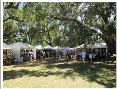
Historic Honey Horn

$5 per person Admission (children under 12 free) Limited capacity - Timed tickets available at www.coastaldiscovery.org 10 a.m. to 5 p.m. Saturday, April 24th and from 11 a.m. to 4 p.m. Sunday, April 25th